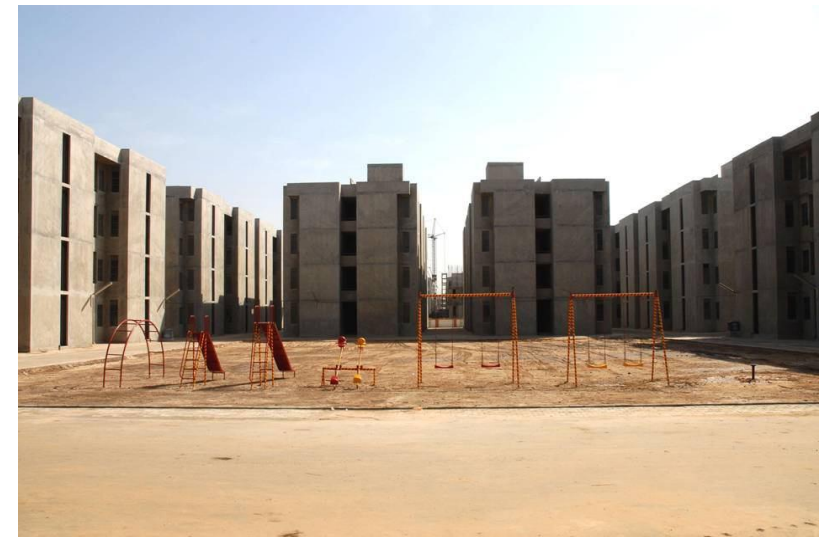
Figure 5: A tot inside the heart of the housing of Ahmedabad Municipal Corporation.