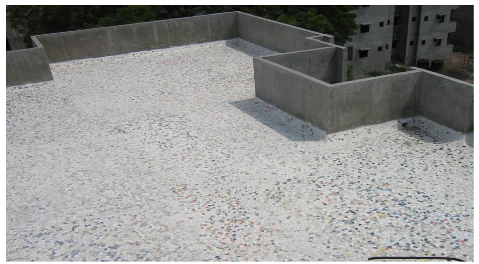
Figure 7: Use of texture and finishes in interiors and roof treatment of dwelling unit.

So in all the cases of Ahmedabad, Durgapur, Hyderabad & Thane Kind of Architecture reflects bold structures, wideruse of concrete ,brick, stone and Technology other than using indigenous materials and low cost material and adoption of low cost technology. This exemplifies certainly a change of idea fashion and test. Sometimes referred as the change in Architectural language, this is called changing vocabulary and grammar of Architecture.