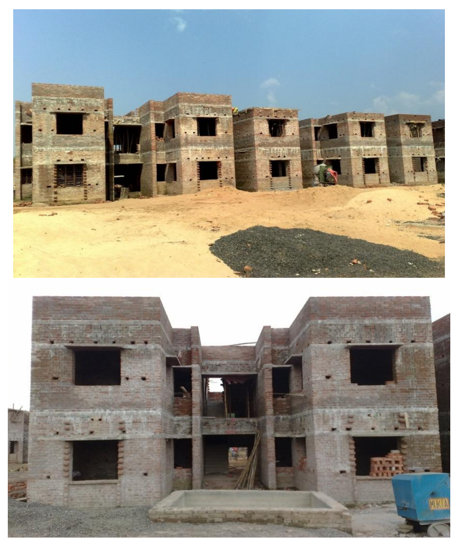
Figure 4: An analysis of the projects of Ahmedabad Municipal corporation manifests strong massing of RCC framed structure with bold form.

Vol. 70 No. 1 (2021) http://philstat.org.ph