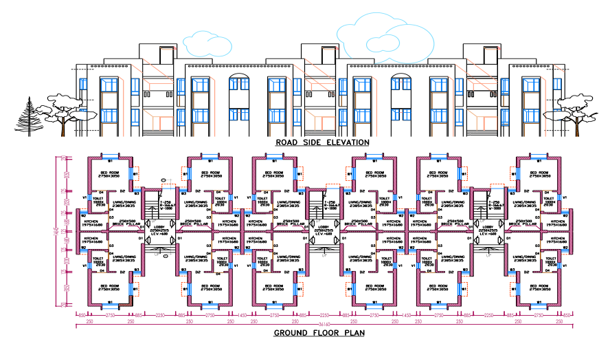
Figure 3: Plan

Mathematical Statistician and Engineering Applications ISSN: 2094-0343 2326-9865