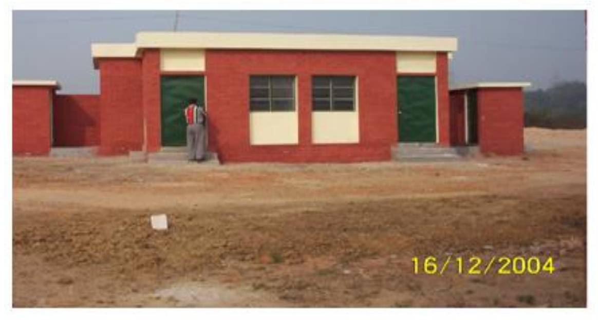
Figure 2:A VAMBAY HOUSE AT DURGAPUR.