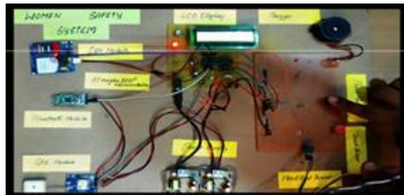
Fig.4; Connecting Iot Device