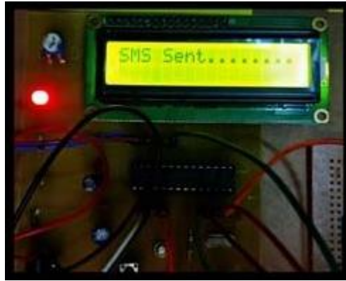
Fig 7: SMS acknowledgement