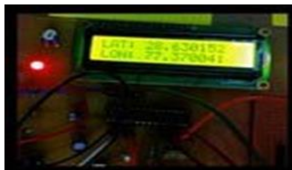
Fig.6 sending the message