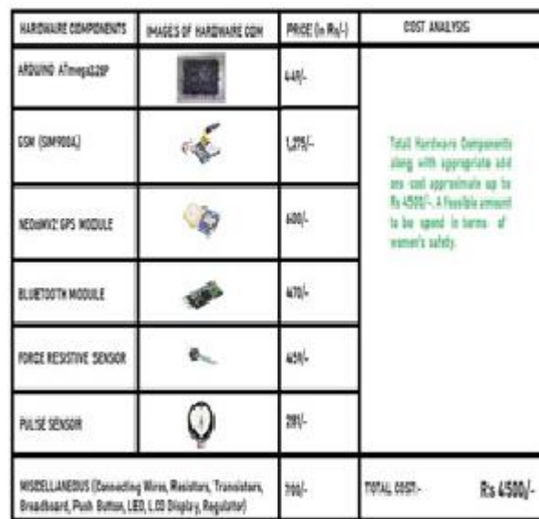
Fig.3:- Cost evaluation for the suggested model

According to the calculations, the round estimated amount is Rs. 4500. If one must purchase something from the marketplace, it will charge between 5000 and 6000 depending on where you get it. However, there are already a large number of other devices with various features and a focus on women's safety available on the market. The first aspect we considered when developing our proposed model was "Economically Feasible Women Safety Device." Whether she is a high class princess or a lowly low class girl, every woman matters. The cost of each component used in its production is clearly shown in the above table. The delivery of this device to the underprivileged can also begin with a warning to those who help them acquire basic necessities, securing their protection and freedom in the future.