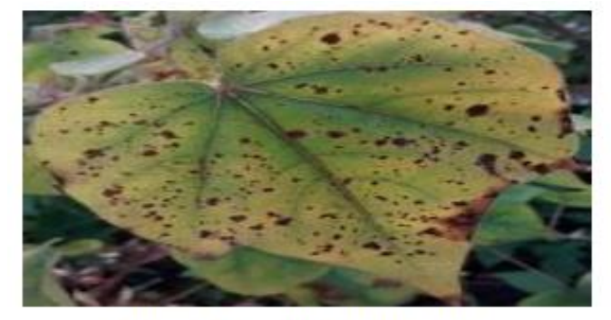
Figure 1. Infected leaf of cotton plant