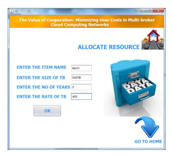
Fig 5: Resource Allocation