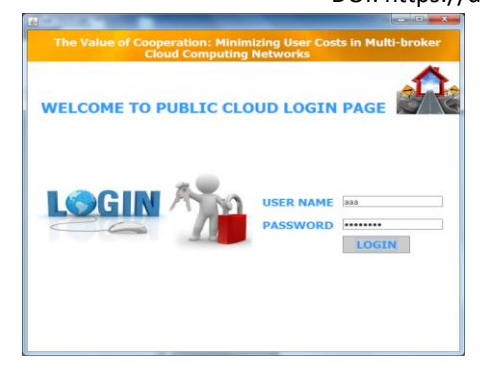
Fig 3: User Login

Mathematical Statistician and Engineering Applications ISSN: 2326-9865 DOI: https://doi.org/10.17762/msea.v70i1.2302