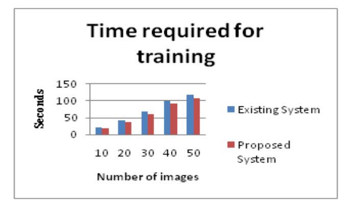
Fig 2: Time required for training images

Experimental result shows that the time required for training of images in our proposed system is less than time required for training in existing system.