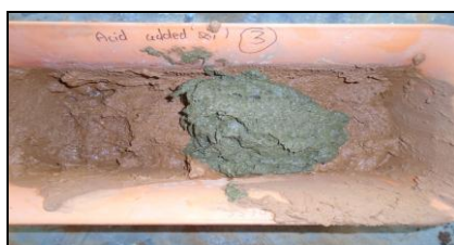
Figure 2: Plastic pot containing acid added soil with cow dung added