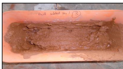
Figure 1: Plastic pot containing acidic solution added soil

From college campus only red garden soil was taken and in 5 plastic pots 2 kg each soil was taken and in five plastic pot acidic water of Ph 1.2 was added to soil samples and immediately small amount of soil was taken for measuring pH and electrical conductivity and than cow dung was added in succession of 200g, 400g, 600g, 800g and 1000g in acidic soils plastic pots and than after 15 days and 40 days soil Ph and electrical conductivity was measured.[10]