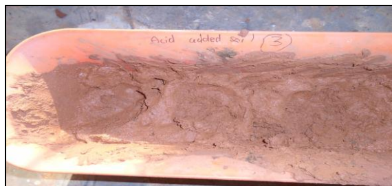
Figure 3: Plastic pot containing acid added soil mixed with cow dung

For knowing the importance of cow from vedic scriptures books like Bhagwat Geeta, Shrimad Bhagvatam, Saint Tukaram Gatha, Nyaneshwari, Puranas, websites related to vedic scriptures were viewed and studied.