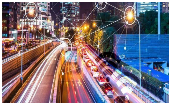
FIG.3 SMART HIGHWAYS

So this paper basically approaches that whenever a new or existing citizen visits the Road they will get all the information on their smartphone with WAU smartapp. It will help the visitor to get the proper destination on time with all the details of the road. The information the roads will be stored on the local server which will be installed on the particular area with all the information of the road. It will display various information like the speed limit, nearby medical facility, name of the road. Shortcuts connected to the roads with precise location with local servers provided by the local authority.