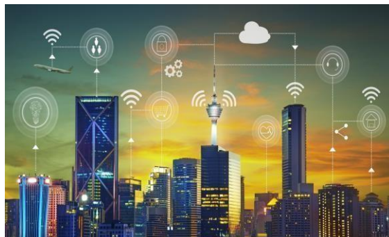
FIG.2 SMART PLACES

This device is not like google places because google won't tell you anything unless and until you search the place on the search bar. Smart server-based app-based devices installed at various famous places will automatically get your location and guides you to explore the places by small animations and by pre-recorded voices of the tourists or the AI software.