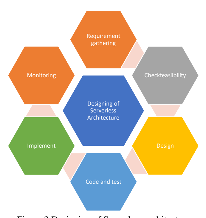
Figure 2 Designing of Serverless architecture

The implementation process is divided into following sub tasks in order to convert the traditional server into serverless architecture: