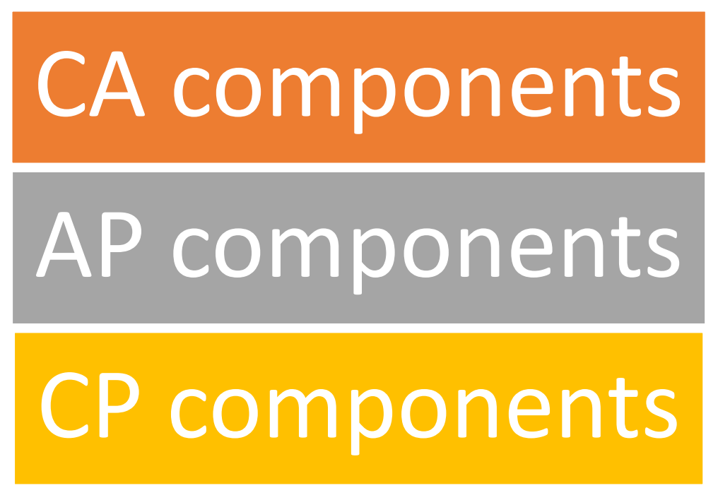
Figure 3. Various combinations of CAP Theorem.