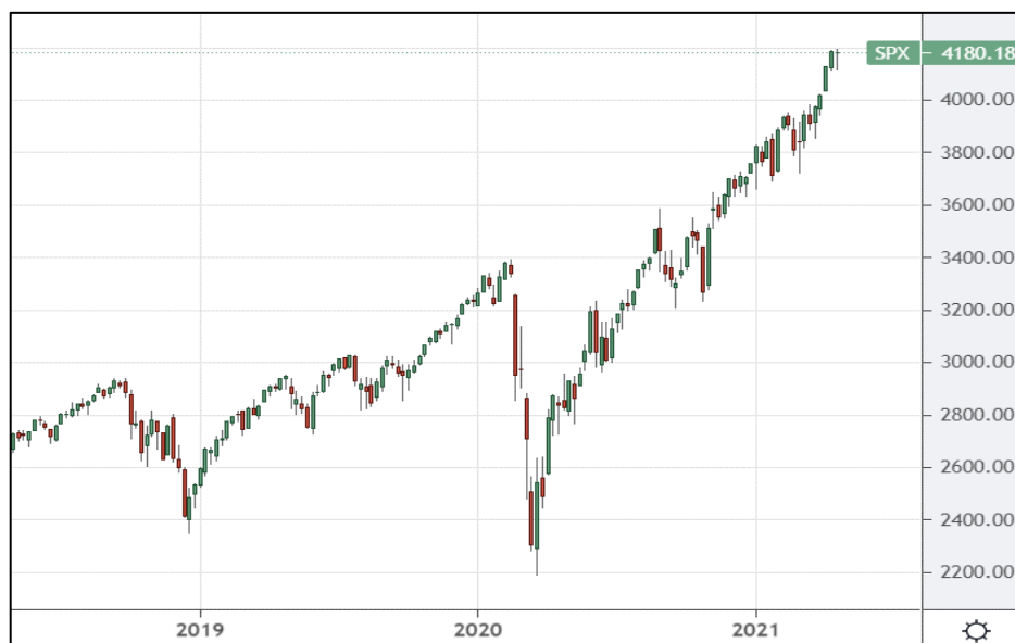
Figure 1 - Dynamics of the S&P500 index before and after the pandemic

In a number of cases, this has led to the unjustified growth of fundamentally weak companies operating in the air transportation, tourism and entertainment sectors. Moreover, contrary to expectations, all major stock indices in the world began to grow in April (Figure 1)